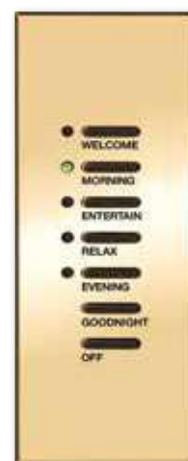
Architrave keypad* (door wide)

* Cannot be ganged with other Architectural-style keypads