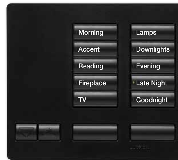
RF seeTouch tabletop keypad in Midnight

* Cannot be ganged with other Architectural-style keypads