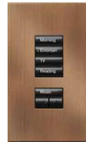
seeTouch keypad without insert