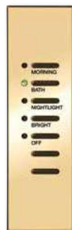
Architrave keypad* (door narrow)