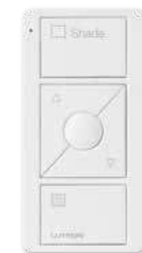
Shade Pico wireless control