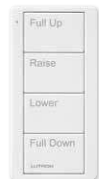
4-button Pico Wireless control for shades