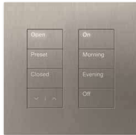
2-gang Palladiom keypad in Satin Nickel