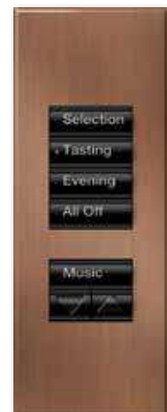
Signature Series keypad*