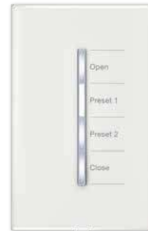
GRAFIK T QS keypad