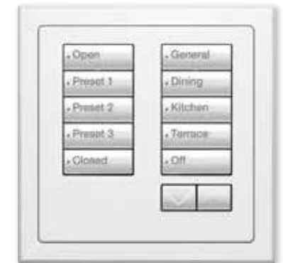
seeTouch keypad with insert