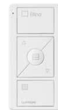
Horizontal Sheer Blinds Pico wireless control